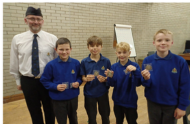
2nd Comber Junior Section Runners-Up of the Battalion Heat of the BBNI Junior Section Quiz

BBNI Junior Section Quiz Battalion Heat Friday 20th October 2023