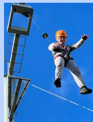
Keen participants on the Drop-zone activity at Ganaway

Available for day visits, overnight residential and camps with a wide range of activities to suit all ages and abilities, give Gareth a call on on 028 9186 1297 or email info@ganaway.co.uk