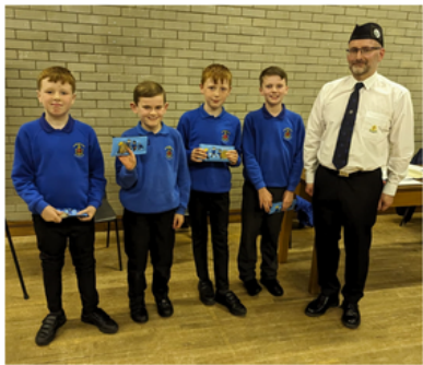
1st Magheragall Junior Section Winners of the Battalion Heat of the BBNI Junior Section Quiz.